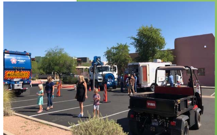
The young and young at heart enjoying the event.