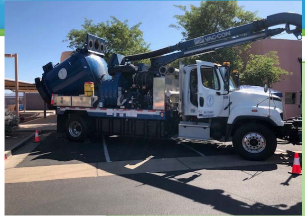
Two of the Fountain Hills Sanitary District's trucks at the event. The top photo is the combination Vac-Con truck and the bottom picture is the camera truck.

The Fountain Hills Sanitary District, Maricopa County Sheriff's Office, Republic Services (trash), Fountain Hills Parks and Recreation, Fountain Hills Streets Department, and Fountain Hills Fire Department all took part in this event, bringing together some great trucks for the family's to touch and climb on.